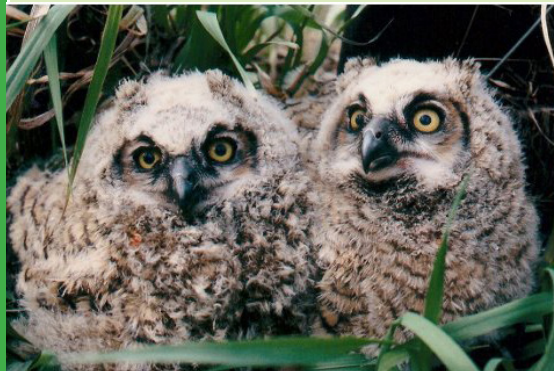
Immature Great-Horned Owls, Cass County, IA

The Conservation Board currently has 14 areas under its management including, Cold Springs, Hitchcock Recreational Area, and Pellett Memorial Woods. These areas provide county residents with a diversity of outdoor activities including; camping, picnicking, swimming, fossil digging, fishing, hunting, and nature study.