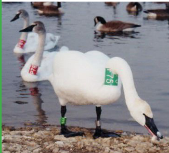
Two young (cygnets), with an adult (F75) at Atlantic

In 1932, Iowa’s native Trumpeter Swans were close to extinction. Only sixty-nine swans remained south of Canada, due to loss of wetlands and unregulated hunting. Iowa’s last Trumpeter Swan nesting occurred in 1883 in northern Iowa.