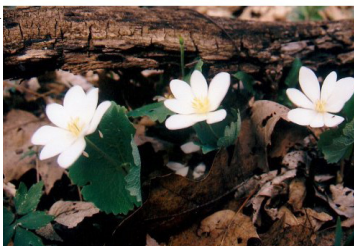
Blood root, Pellett Memorial Woods

Residents of Cass County are fortunate to have an abundance of natural resources available for their use and enjoyment. More than 200 different kinds of plants and many species of animals inhabit the roadsides, fields and forests of the county. People can enjoy the abundant wildlife and beautiful wildflowers that can be found during a walk through one of the county conservation areas.